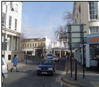
Figure 8 Section of Ring Road

At the two highest levels of the grid system, the main north-south and east – west streets are an important part of the town centre approach and ring roads. As such traffic is a dominant feature of the space in these streets – noise, signage, markings and the presence of high traffic volumes. The ring road (which through the area runs along Bath Road, Oriel Road, St Georges Road and Royal Well) has fast moving one-way traffic and is a significant barrier to pedestrian movement into and out of the town centre