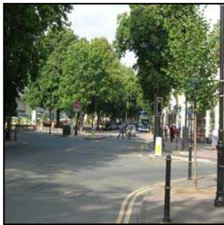
Figure 66 Trees within Promenade

The Promenade is tree lined on either side – with a double row of trees on the west. These mature, well established trees are important in influencing the character and appearance of the Promenade. Species comprise of oak, horse chestnut, plane, lime and tulip trees. Along the west side of Imperial Gardens on the Promenade are plane, silver birch, oak and lime trees. The upper part of the Promenade contains a fine and characteristic line of plane trees. Formal gardens outside the Municipal Offices enhance the setting of this Grade II* listed building and enhance its grandeur and importance. They also provide a setting for the statues situated along this strip of garden.