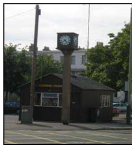
Figure 47 Royal Well bus station

Royal Crescent bus station - A clock is located by the taxi rank in the Royal Well bus station. The clock dates from c.1950. It is four-sided, with Roman numerals supported by brackets atop a single pier. This item of street furniture has strong local interest and adds to the historic character and appearance of the street scene within this area.