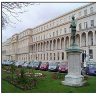
Figure 21 Municipal Offices

Montpellier contains large areas of housing. Extensive Regency terraces are positioned along Montpellier Spa Road, Royal Crescent, Imperial Square and Bath Road. The continued presence of a number of uniform houses and terraces enhances the character and appearance not just of Montpellier but of the central conservation area as a whole and contributes to its special qualities. A number of detached houses are evident, some set within large grounds. They often reflect the historic plot form of houses within Montpellier. The recent completion of a contemporary housing development on the site of the former Victory Club, has helped enhance this corner of Imperial Square. Flats are also located above Regency shops and in a number of modern blocks e.g. The Pavilions. Cambray Court is an interesting example of 1930's development, which is not a typical building of this historic area.