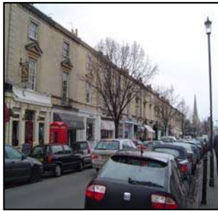
Figure 20 Leisure uses on Montpellier Street

There are a number of offices located throughout the character area, for example in The Promenade, Rodney Road, Bath Road, Regent Street, Crescent Place and Imperial Square. Whereas some of these offices are housed within modern office blocks of various styles, others are located within converted Regency houses. This is evident along the Promenade (where the Municipal Offices are located) and Bath Road. These offices of all types bring economic power and prosperity to the area.