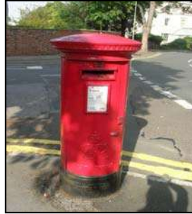
Figure 46 Post box in Montpellier

Montpellier Parade - The Parade contains a GR VI post box which dates from the mid 20 th century. This item of street furniture has strong local interest and enhances the historic character and appearance of the area. It is also an example of a traditional historic item of street furniture within British villages, towns and cities.