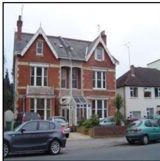
Figure 68 Front gardens & hard-standing on villas

In the present day, the private gardens of many terraces have been converted into hard-standing for cars. However, villas (in Montpellier Parade and Vittoria Walk for example) have generally retained their large spacious gardens (with car parking often restricted to carriage drives). It is important that gardens are retained where possible as their presence enhances the character and appearance of not just the buildings, but the area generally, which is especially important due to Montpellier's urban character and close proximity to the town centre.