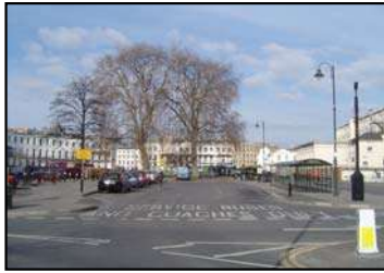
Figure 3 Royal Well bus station (Royal Crescent to left )

2.6 The River Chelt passes east-west through the centre of the character area. For much of its length here, it is culverted, and where it is open (in the east) it is largely hidden from public view and currently has little impact. The land north of the Chelt is flat, but to the south it gently rises giving the Queens Hotel, for example, an imposing slightly elevated setting in views along the tree-lined Promenade.