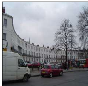
Figure 22 Royal Crescent