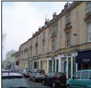
Figure 19 Shops on Montpellier Street

Two major uses in Montpellier are retail and catering. In Montpellier Street and Montpellier Walk there are many specialist, small sole-trader shops plus cafes, bars, pubs and restaurants. This blend of uses provides varying levels of activity and noise throughout the day - shops generating day-time activity and low noise levels; pubs and restaurants generating higher noise levels and significant activity in the evening and during weekends. The buildings between these two streets are interesting on two counts - their appearance on the Walk side is greatly enhanced by the presence of the caryatids which support the upper floors; whilst additionally, they uniquely have a frontage to both streets – generally with a single room width at ground floor. The Promenade generally has larger shop units housing national high-end shops (including fashionable boutiques) which give it a