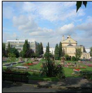
Figure 62 Trees present in Imperial Gardens