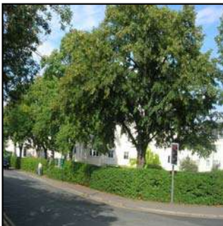
Figure 69 Lime trees with TPOs in grounds of the Pavilions

All trees within Montpellier are protected due to their position in a conservation area, however, many have Tree Preservation Orders (TPOs) which demonstrates their importance and significance to their locale. Trees with Orders placed on them include the row of young limes within the grounds of the Pavilions, between Paragon Terrace and Sandford Road. They partially screen the flats from public space, and their presence in the area is valuable in that they provide an attractive contrast