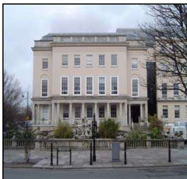
Figure 36 Royscot House

completed in 1987 at a cost of £3 million;