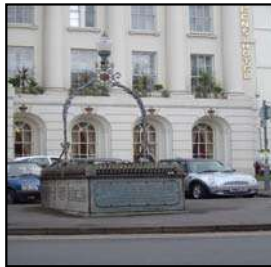
Figure 53 Crimean War Memorial

a. On the west side of the Promenade is sited a Boer War Memorial erected in 1907. It consists of a bronze statue of a soldier with names inscribed on the stone plinth and on steps. It occupies a visually prominent position on the corner of the Promenade and Crescent Terrace. This local detail is particularly important in that it illustrates the role Cheltenham played in this war which in turn enhances the historic interest of the area. Further south on the western side of the Promenade in front of the entrance to the Municipal Offices is the First World War memorial Cenotaph erected in 1921.