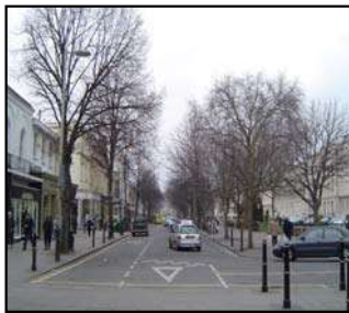
Figure 12 Tree lined Promenade

There is abundant tree planting in all of the more spacious streets. However The Promenade north of the Queens Hotel is particularly impressive, being lined with trees on both sides for its complete length – including a double row along the western pavement. However, north of Cavendish House all planting and public space provision stops until Clarence Square and Pittville Park.