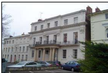
Figure 28 Villa on Bath Road