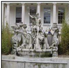
Figure 57 Neptune Fountain