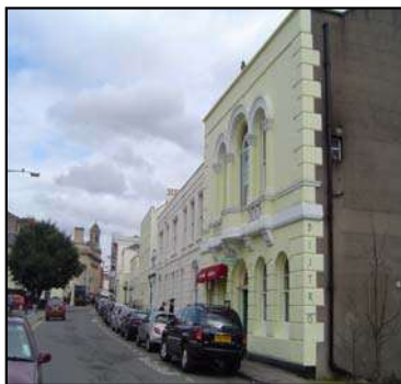
Figure 40 No. 24 Rodney Road