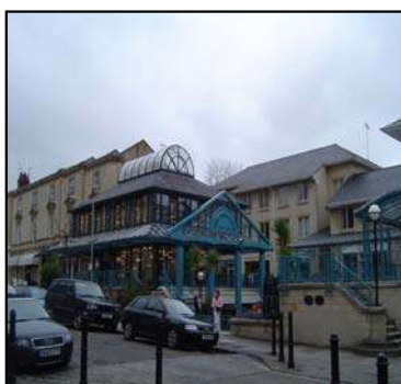
Figure 37 The Courtyard