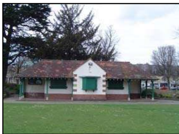
Figure 45 The refreshment kiosk

d. The refreshment kiosk is seen as a key unlisted building within the Montpellier character area because: