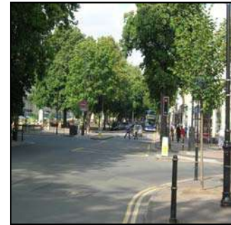
Figure 65 Trees within Montpellier Gardens