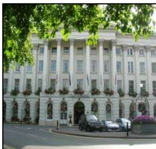
Figure 32 Architectural detailing on Queen's Hotel

Neo-Palladian influenced architecture is present at the Queen's Hotel. The Queen's Hotel has a very strong architectural design, with a resemblance to some of the classical Russian buildings in old St Petersburg. Its main façade has in the middle, a six-columned Corinthian portico above a base of rusticated arches. The model for its tall Corinthian columns is said to have been one of the Temples of Jupiter in Rome.