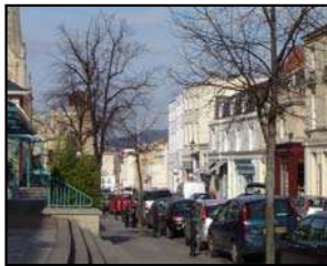
Figure 5 View of Cleeve Hill from Montpellier Street

Although Montpellier is in the centre of the town, there are frequent glimpses and views of Cleeve Hill and the Cotswold escarpment from open spaces and gaps between buildings creating a strong connection between the countryside and urban area – particularly in the slightly elevated south. Although the River Chelt, as it runs through the area, is largely unseen, both to the west and the east of the character area it is an important landscape feature, running through open space and linear parkland.