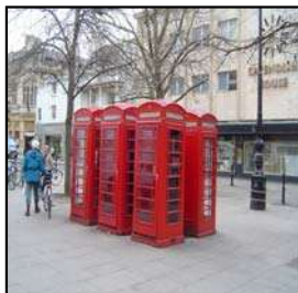
Figure 50 Telephone boxes on the Promenade

In total, ten K6 telephone boxes are positioned on the Promenade and one is positioned outside the Salisbury Arms Public House on Montpellier Street. They were designed in 1935 by Sir Giles Gilbert Scott and are all Grade II listed. These typically English telephone boxes enhance the historic interest of their locales and are visually attractive compared to the modern telephone boxes present in other streets.