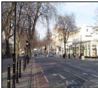
Figure 9 Junction of Promenade/Oriel Road/St George's Road

The offset nature of the grid creates a number of large spaces at junctions. Most are dominated by traffic and its associated clutter and are visually degraded and difficult spaces for pedestrians as a result. However spaces such as Royal Well, the Regent Street/Rodney Road junction and the junction of The Promenade, Oriel Road and St Georges Road have great potential for visual enhancement and pedestrian improvements.