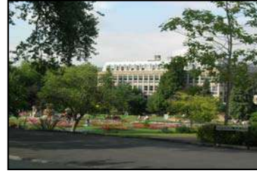
Figure 27 The Quadrangle poorly addresses its historic surroundings