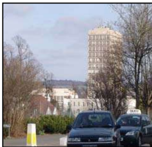
Figure 17 View of Cotswold Scarp and Eagle Tower from top of Montpellier Walk

As with much of the town there are glimpses of Cleeve Hill in several areas, through gaps between buildings and trees. This creates strong link between the built-up area and its rural surroundings and forms a welcome foil to the sense of enclosure generally experienced in a town. The nature of the views alters throughout the area – for example the rising land form south of the river allows extensive views of Cleeve Hill from the top of Montpellier Walk through trees; conversely, there is a pinched glimpse of the scarp from the Promenade at Cavendish House, along North Street.