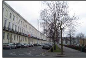
Figure 29 Imperial Square terraces