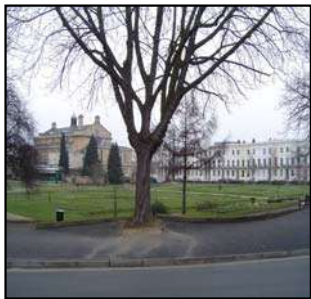
Figure 24 Formal Imperial Gardens

Leisure pursuits are catered for at the extensive Imperial and Montpellier Gardens. These formal gardens are important not only for the setting they establish for surrounding houses, but for the quiet space they provide in the centre of the town, enhancing both the character and appearance of Montpellier.