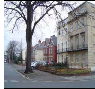
Figure 13 Buildings addressing streets