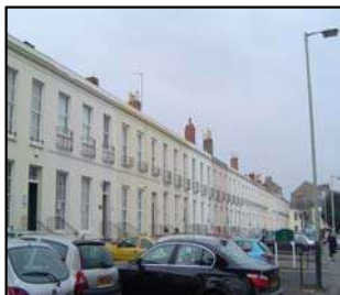
Figure 15 Intense parking in Rodney Road

While much of the historical setting of the frontage is intact, many front gardens have been given over to parking. This frequently has a detrimental impact on street scene – particularly where it is intense, as part of an office use. Rodney Road and the southern part of the Promenade have been poorly treated in this regard. In Rodney Road, the intense parking is coupled with almost complete removal of boundary treatments in one section, which has further downgraded the quality of the street and its enclosure. The Royal Crescent is now set behind a hard coach drive and, beyond that, the bus station,