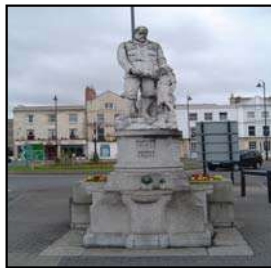
Figure 54 Edward VII statue & drinking fountain

b. A Crimean War Memorial dating from the 1850s is erected at the top of the Promenade outside the Queen's Hotel. A large iron plinth contains names of soldiers. This Grade II listed structure is seen as 'a very rare and notable monument to the Crimean War' according to the list description. A cannon, taken at Sebastopol in 1856 formerly stood on the plinth but was removed and handed to the government during World War II to provide metal for armaments. This local detail is particularly important in that it illustrates the role Cheltenham played in this war which in turn enhances the historic interest of the area.