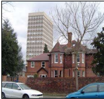
Figure 38 No's 8 & 10 Montpellier Parade