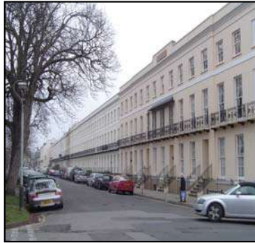
Figure 35 Montpellier Spa Road terraces