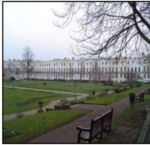
Figure 16 Imperial Square

However, overall the historic and some of the modern developments generally benefit the streets and spaces by their enclosure. The terraces are imposing – generally at 3-storeys plus basement. Despite their length and strong uniformity, the window pattern and columns give a strong vertical rhythm which is a characteristic of the Regency town. This is frequently enhanced by a tall first floor window, often with a wrought iron balcony. The villas are set back in space and give a sense of grandeur. Some modern buildings have adopted these positive characteristics – particularly on the Broad Walk.