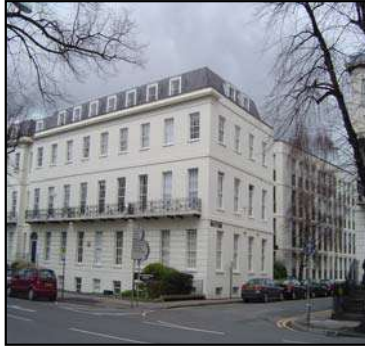
Figure 41 Ellenborough House

h. Ellenborough House on the corner of Oriel Road and Wellington Street because: