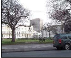
Figure 6 View of landmark Eagle Star from the Promenade

There are also a number of landmark buildings of varying height and scale which punctuate views of the skyline from within and outside the character area. These include the Queen's Hotel, Cambray Court, Municipal Offices and Cavendish House, but the most dominant is Eagle Tower. This 13 storey block was built in the late 1960's and is visible from both street level and upper floors in many parts of the town.