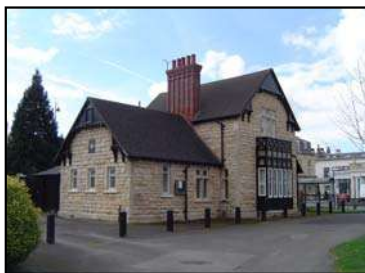
Figure 44 The Park Lodge

c. The park lodge is seen as a key unlisted building within the Montpellier character area because: