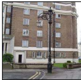
Figure 48 Example of 'Dragon and Onion' lamp post in Cambray Place

'Dragon and Onion' lamp posts – these lamps are present in Cambray Place, Regent Street and Trafalgar Street within the Montpellier character area, and St Mary's Churchyard, Church Street which is located in the central character area. They date from the late 19 th century. The lamp post in Regent Street is older, dating from 1869. They were intended for electricity and are thus an early and elaborate example of their type. The motif displayed on them is taken from the coat of arms of the Borough which enhances their historic interest.