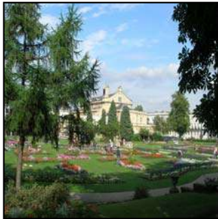
Figure 61 Open space of Imperial Gardens