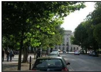
Figure 4 Elevated setting of Queen's Hotel

2.7 Across the character area as a whole there is a distinct shift in character. The tighter urban grain in the northeast quadrant loosens to the south and west giving way eventually to broad tree-lined streets and formal gardens. Terraces dominate, but the looser grain and larger urban block size historically allowed the introduction of villas, some now replaced with large office buildings.