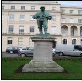
Figure 55 Edward Wilson statue