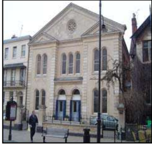
Figure 23 Cambray Baptist Church

within the centre of many urban areas. Their location close by each other helps to create a vibrant and vital mixed use area in the core of the town.