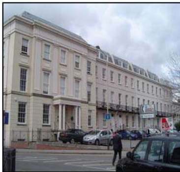
Figure 39 Rodney Road