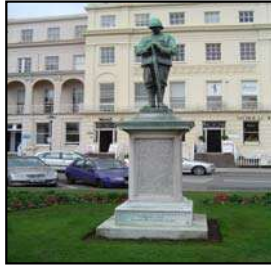
Figure 52 Boer War Memorial

5.27 Many statues, memorials and works of public art are located within the Montpellier character area. Many illustrate Cheltenham's history or are public art works typical of their period. Between them they enrich the area's historic interest and enhance its character. The Council is developing its public art strategy and has placed public art at the heart of its Civic Pride initiative.