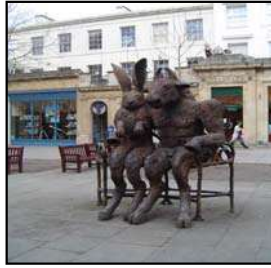
Figure 58 Minotaur and Hare sculpture