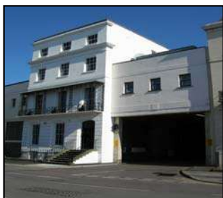
Figure 10 Entrance to Regent Arcade car park

At the lower levels, the disjointed east-west links create tortuous journeys across the area, particularly north of Oriel Road. While there are some quiet spaces and streets created in this area, the street scene in Regent Street and Rodney Road between Oriel Place and the entrance to the Regent Arcade car park is a neglected and difficult pedestrian environment.