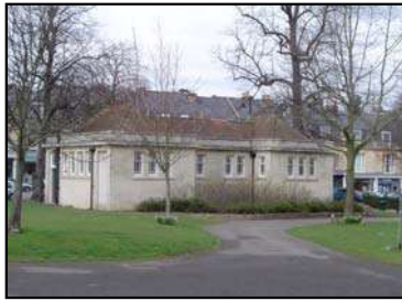
Figure 43 The public convenience