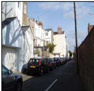
Figure 14 Example of service lane

In addition, there are a number of rear service lanes. Often there will be a high brick wall between the lane and the property's rear yard (e.g. Montpellier Street at rear of the Promenade and rear of Montpellier Terrace). Occasionally, some of the terraces' buildings back directly onto the lanes, with rear yards open to them.