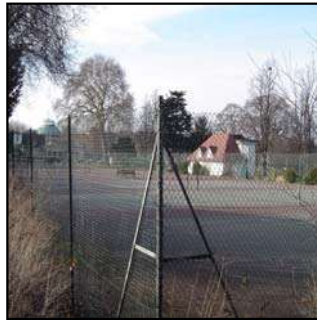
Figure 64 Tennis courts in Montpellier Gardens