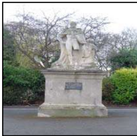
Figure 56 William IV statue