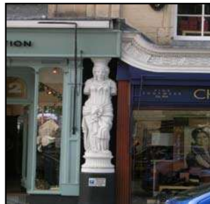
Figure 31 Caryatids on Montpellier Walk