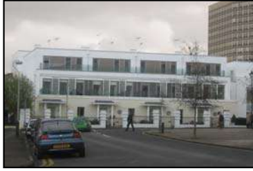
Figure 26 Complementary recent development in the corner of Imperial Square