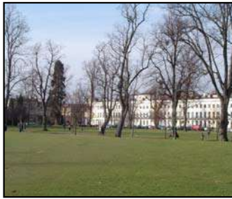
Figure 11 Montpellier Gardens

4.5 Where street space and block size allow, there is plentiful open space and street planting, but opportunities gradually decrease to the north. For example, following the tree-lined Promenade there is