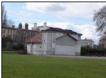
Figure 42 The Proscenium

a. The proscenium is seen as a key unlisted building within the Montpellier character area because: