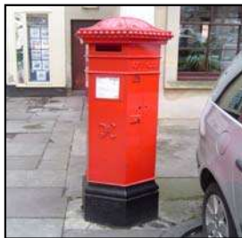
Figure 49 Cast-iron pillar box on Montpellier Walk

A late 19th century cast-iron pillar box is located outside Hanover House on Montpellier Walk. It was designed by JW Penfold and is Grade II listed. Cheltenham has 8 of the 94 surviving Penfold-type Victorian pillar boxes reputed to remain in the country. This greatly enhances its special historic value and reflects the history of the area.