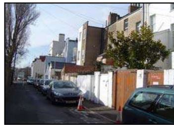
Figure 2 Example of service lane – Back Montpellier Terrace