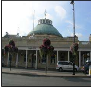
Figure 30 The Rotunda Walk

After the Old Well was established on the site of Cheltenham's Ladies College in 1738, the Montpellier Spa built by Henry Thompson, was erected in 1809. It was constructed on what is now the site of the Lloyds Bank, Montpellier Rotunda. The earliest building at Montpellier was the Pump Room. The present building is Grade I listed, being one of five Grade I listed buildings within Cheltenham Borough, meaning the building is of 'exceptional interest'. The Rotunda greatly enhances the historic character and appearance now just of the Montpellier character area, but of the central conservation area as a whole.