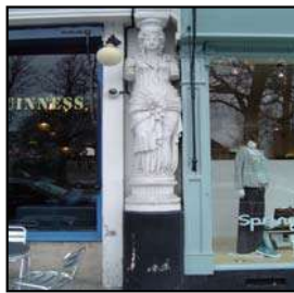
Figure 59 Caryatids positioned along Montpellier Walk