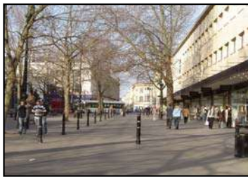
Figure 1 Plan form of Promenade

2.4 Inside this higher level grid at a third and fourth level are a series of streets and service lanes creating a finer grained network – again, principally on a north-south alignment but with disjointed east-west linkages.