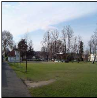
Figure 63 Open space of Montpellier Gardens

the Gardens provide a popular recreational resource. The presence of the William IV statue and historic structures adds to the historic and cultural interest of the Gardens and contribute to its character and appearance. The Gardens also provide an attractive setting for these features. Medium and long distance views are permitted across the Gardens through its flat plan form, creating a sense of space. Mature, well established trees within the Gardens include the species horse chestnut, lime, beech, wellingtonia, yew, cyprus and oak. This variety adds to the Garden's interest. Trees are situated throughout the Gardens and its edges, which provide screening to buildings and act as a boundary treatment by softening edges between the Gardens and pavements. The avenues consist of lime, copper, beech, plane and horse chestnut trees and the north- west section of the Gardens is its 'arboretum' area, which contains a variety of tree species. The Montpellier Gardens are currently undergoing restoration under the Heritage Lottery Fund, with a design based on their historic layout. Both the Imperial and Montpellier Gardens are extremely important historic open spaces within the Montpellier character area and need to be well protected and conserved.