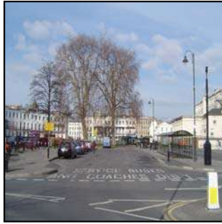
Figure 67 Greenery within Royal Well bus station

In the 19 th century, the site of the present Royal Well bus station consisted of open land with trees and was named Crescent Gardens. A path ran through what is now a car-park in front of Royal Crescent. Hedgerow currently separates the car-park from the bus station and screens the two areas acting as a 'soft' boundary. Two large mature plane trees in the centre of the bus station dominate the area and enhance its character and appearance. They have historic value, dating from the time of the Regency spa. Two feature trees are also sited near to the hedgerow. The presence of these trees and hedgerow softens the 'hard' appearance of the bus station and enhances the setting of the striking Royal Crescent terraces. However, the space is poorly served generally by the bus station and Inner Ring Road. The Council's Civic Pride initiative is considering how the area can be enhanced.