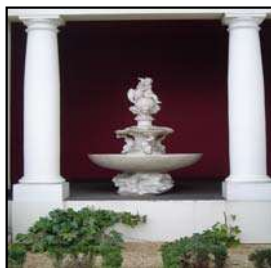
Figure 60 The Imperial Fountain