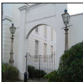
Figure 51 Lamp standards by Queen's Hotel

A pair of historic lamp standards are located to the south east of the Queen's Hotel at the top of the Promenade. They are Grade II listed, dating from c.1838. Gas holders on top survive, converted to electricity. These lamps are special in that they survive from the beginning of the Victorian period and flank the historic stable entrance of the Queen's Hotel, enhancing their historic interest.