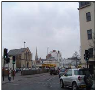
Figure 25 Part of Ring Road

The Montpellier character area contains parts of the Inner Ring Road - which carries heavy volumes of traffic particularly in rush hour- and parts of approach roads from the south (Bath Road) and the west (Lansdown Road feeds Montpellier Walk and Terrace). Consequently there are high levels of traffic activity and noise throughout the day. The presence of these routes through the area has a significant impact on ease of pedestrian and cycle movement, which is particularly constrained in the south across Montpellier Walk and at the junction of the Promenade, St George's Road and Imperial Square. The routes also bring with them a plethora of highway signage and paraphernalia. They generally have a negative impact on the character and appearance of Montpellier.