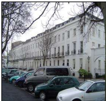
Figure 34 The Broad Walk