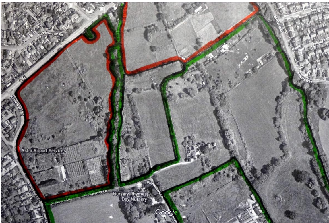
Figure 2: Satellite view of the smallholdings and showing the boundary of the Northern Fields in red and the boundary of the LGS in green.

https://www.google.com/maps/@51.8809282,-2.0890269,248m/data=!3m1!1e3